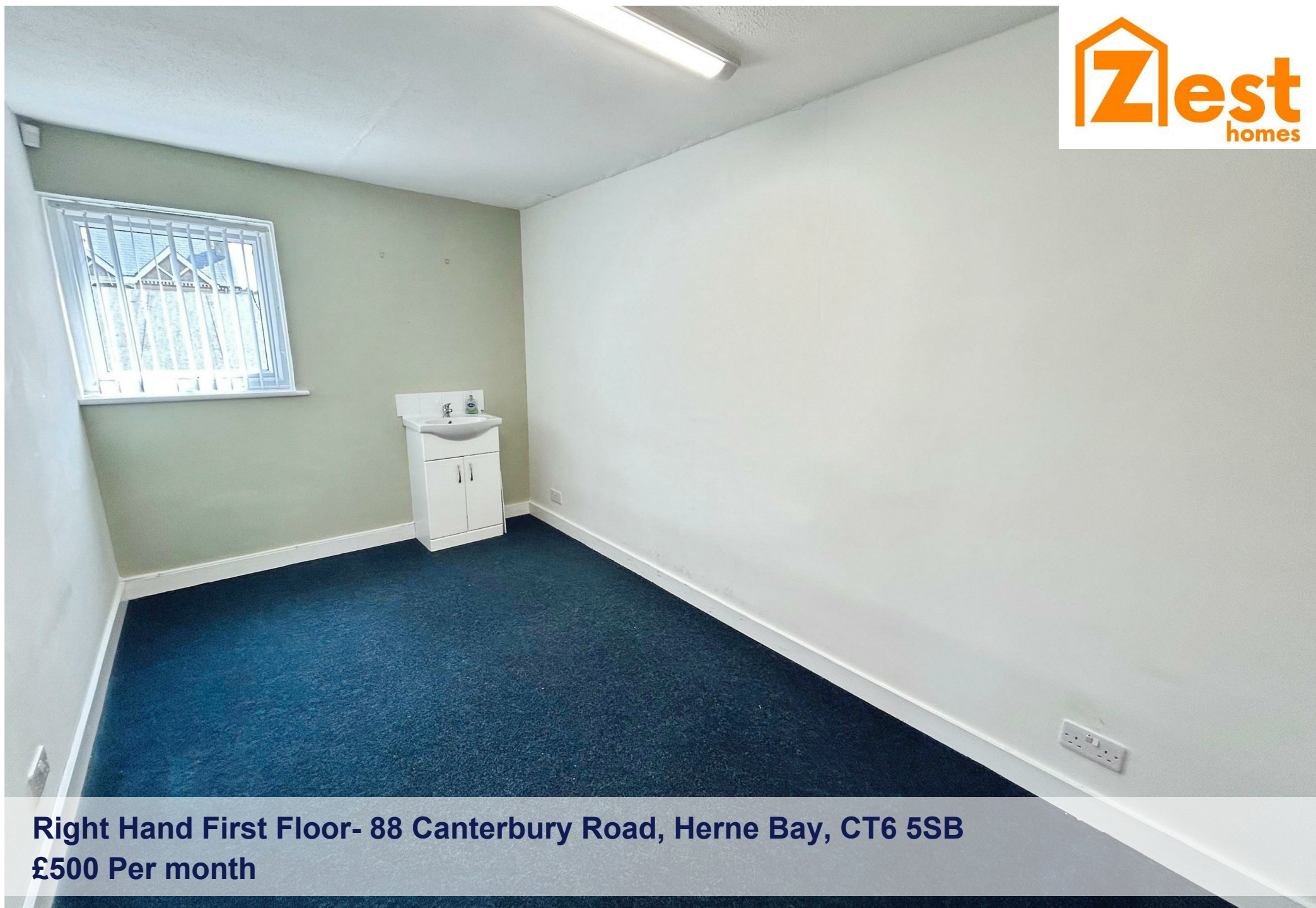
Right Hand First Floor- 88 Canterbury Road, Herne Bay, CT6 5SB £500 Per month